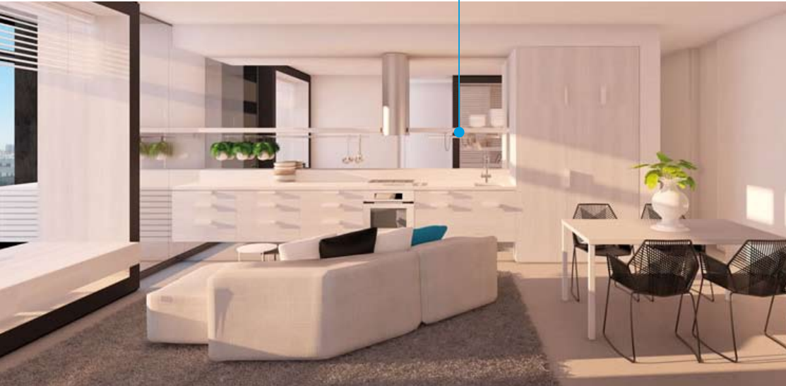
Living area - light scheme