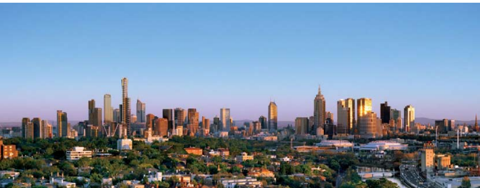
North west view to city, dawn