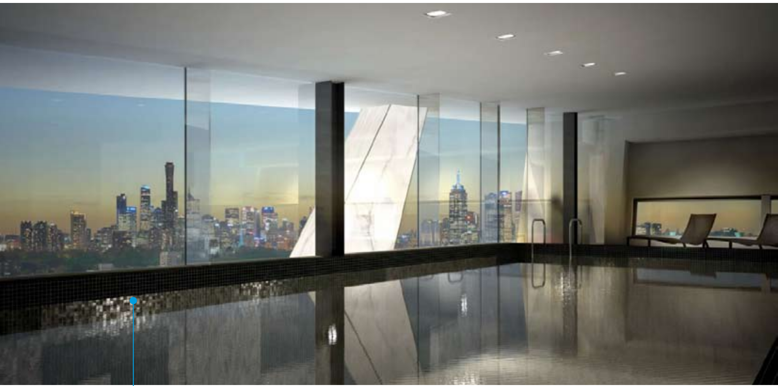
Rooftop pool and gym