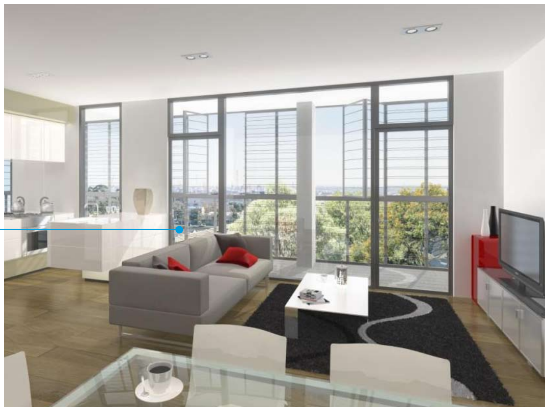
2 bedroom apartment