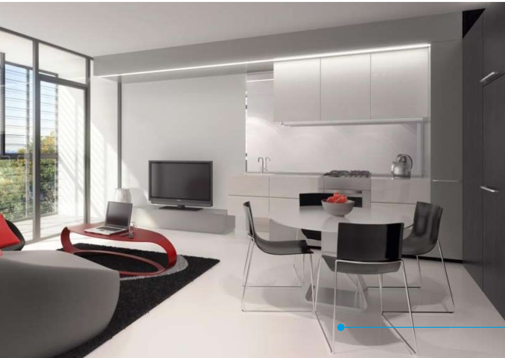
1 bedroom apartment