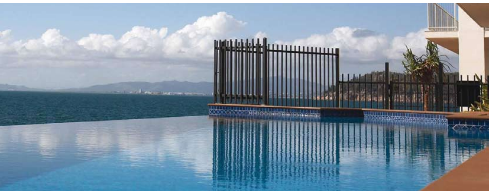
View from the pool